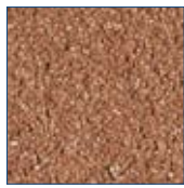
Coated Traditional Red