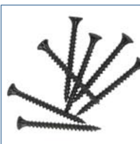
Screws 40 x (4.0 x 45)