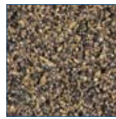
Coated Broadleaf Brown