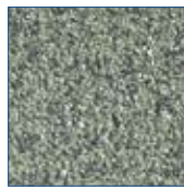
Coated Forest Green